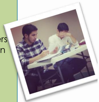
First day receiving letters from the Church

The idea of creating friendships through mentoring sounded appealing yet scary. One girl exclaimed, "WAIT!, that means someone is going to know the real me." "That's exactly the objective," I explained. Because those responding to their letters will not judge, repudiate or criticize them, they are able to open up with more confidence. The Apostle Paul used his own transparency to deal with the internal issues of the church he became their encourager, their mentor, their comforter, their counselor and their friend. I presented the project to my Bible School students and explained the purpose of the letters. The students would become Paul the encourager, they would learn to develop a pastoral heart and how to deal with universal issues that all people face. As a result, these letters have provided: encouragement, discipleship, friendship-mentorship, counseling, a meaning to their experiences and healing. Every week the girls waited in anticipation for their letters from Paul because they finally found a way to strengthen and connect their feelings through the mode of writing. These letters give them a clearer picture of their lives and how to process the decisions they have to make. Indeed, writing can be therapeutic empowers one to become free in Christ!