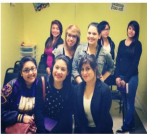
The Church (Girls Only Club)