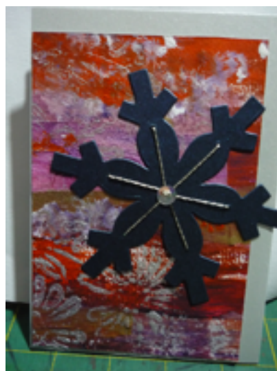
Xmas card FREE workshop sample