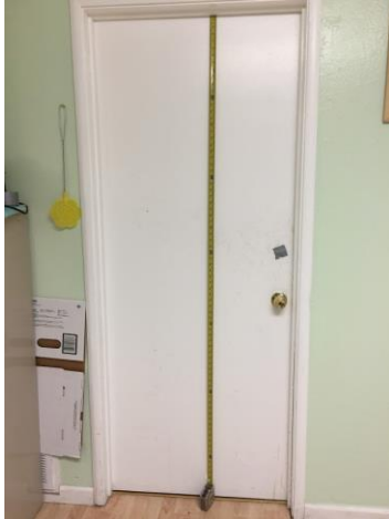
Step 2: measure width of opening to infirmary