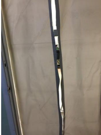
Step 20: Step inside dcon and cut door barrier