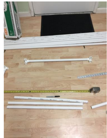
Step 7: attached piping corner joints