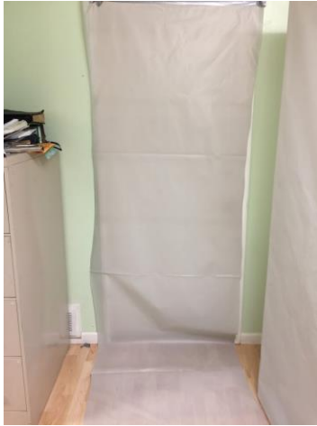
Step 15: secure poly over opening with duct tape