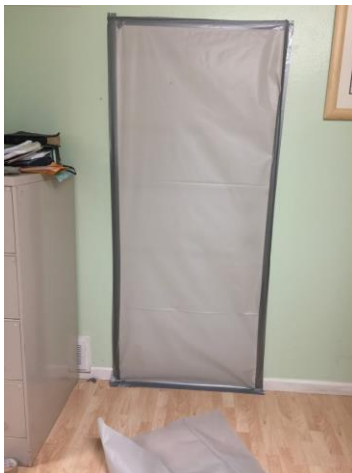
Use Duct tape to seal poly to door frame