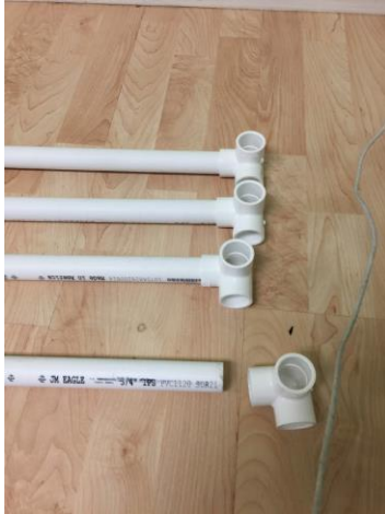
Step 8: assemble piping, one side at a time