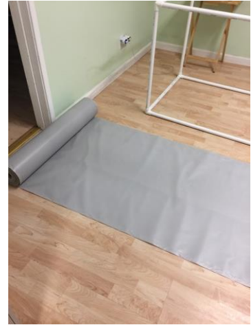
Roll 6 mil poly at least 36 inches past bottom