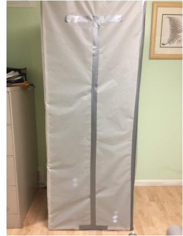
Step 19: cut an opening in the taped marking