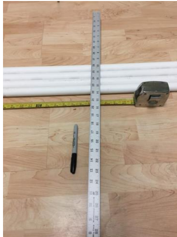
Step 4: mark piping measurements with marker