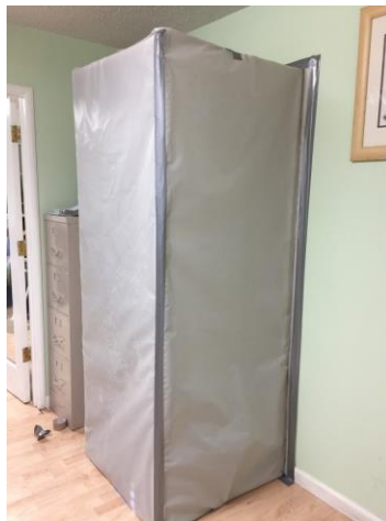
Push cube to door barrier and tape seal barrier to dcon