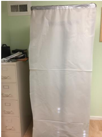
Cut a Seal flap for dcon