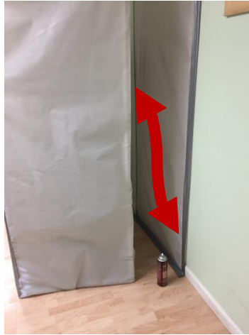
Step 17: place d-con in front of opening, spray glue dcon and barrier