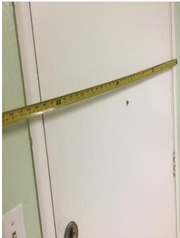
Step 3: measure piping to opening size