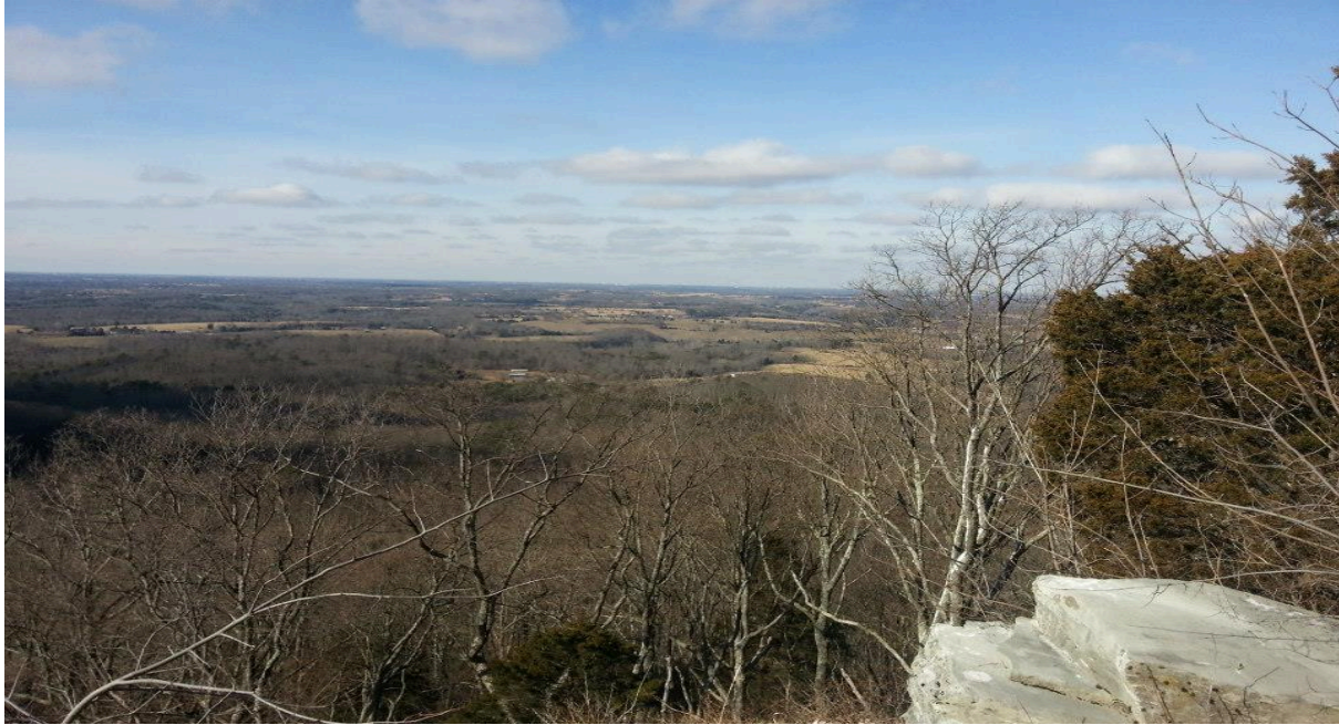
*View from the point of Lily Mountain looking toward Richmond (EKU Campus)