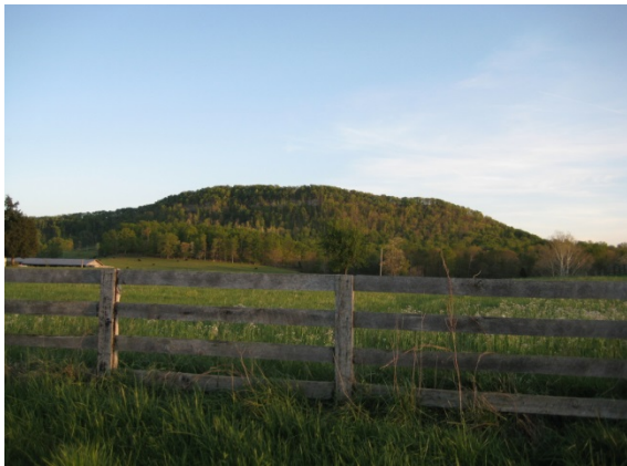
*View of Lily Mountain from road