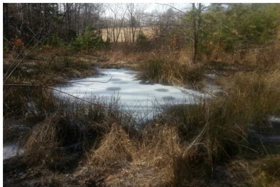
*Frozen Wetland Pond