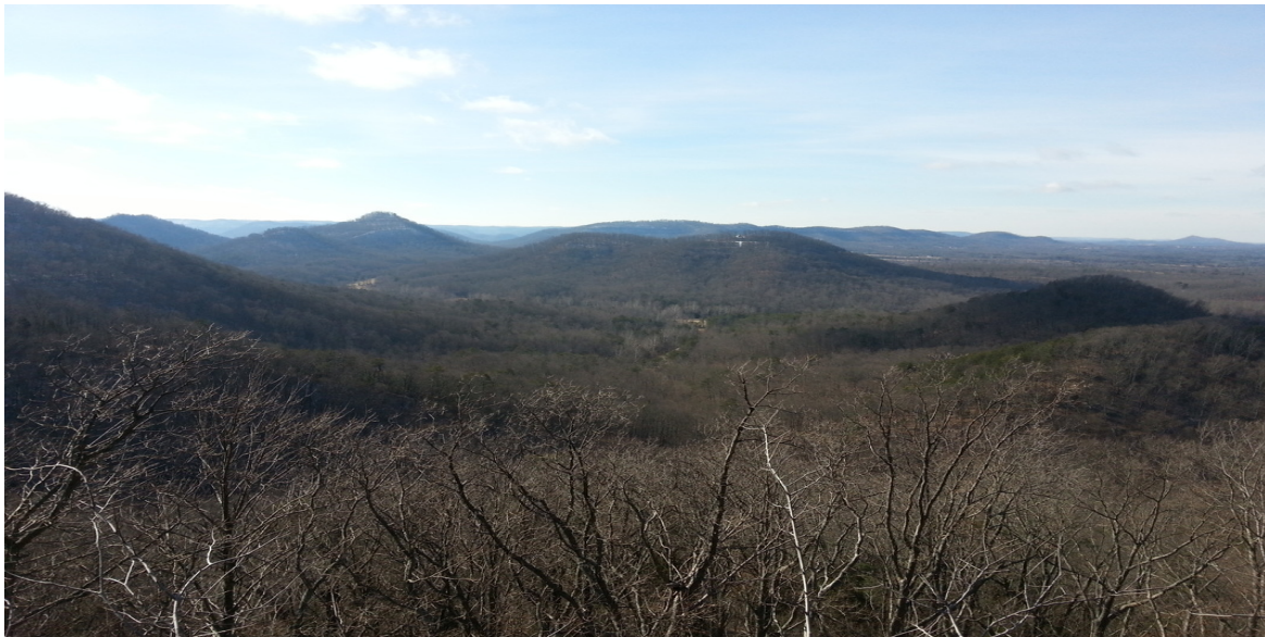
*View from the point of Lily Mountain toward Kingston/Berea.

Our goal is to protect and restore the land with its natural resources while providing for appropriate public use. This will include recreational uses such as hiking trails that vary in difficulty from easy to challenge, enhancement of wetland areas, areas for bird watching, other nature study activities and the promotion of nature photography and art opportunities such as drawing and painting of, and in communion with nature. The District will implement land restoration projects such as forest improvement, invasive species removal and native plan establishment. Educational programs on land management, wildlife management and restoration, as well as studies on the historical and cultural resources would be offered by the Conservation District as partners. The area will also be made available to small groups for environmental education study and to students from nearby universities and colleges to conduct research.