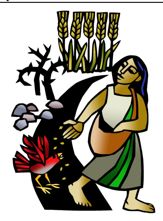
Service of the Word Weekly Resource for Prayer and Devotions at Home