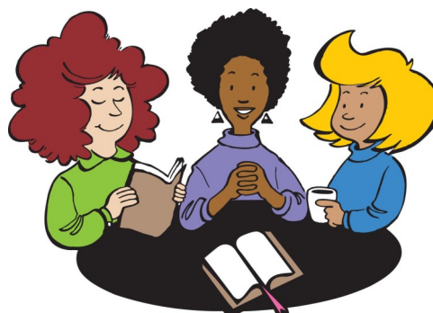
Ladies Bible Study

Ladies, we're getting a late start with Ladies Bible Study, but we are going to begin the first Wednesday in October from 9 to 12 in the church library. If you haven't joined us in the past, but you want to do a serious study of the Bible, you are invited to meet with us every Wednesday morning! We will continue our study in Genesis, but we are going to incorporate the Bible study methods recommended by Jen Wilkin in her book "Women of the