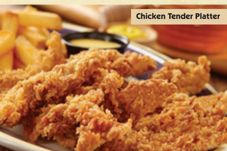
Chicken Tender Platter