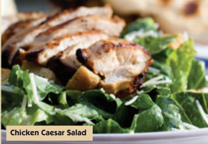
Chicken Caesar Salad

Try one of our house specialties, we know you'll love 'em!