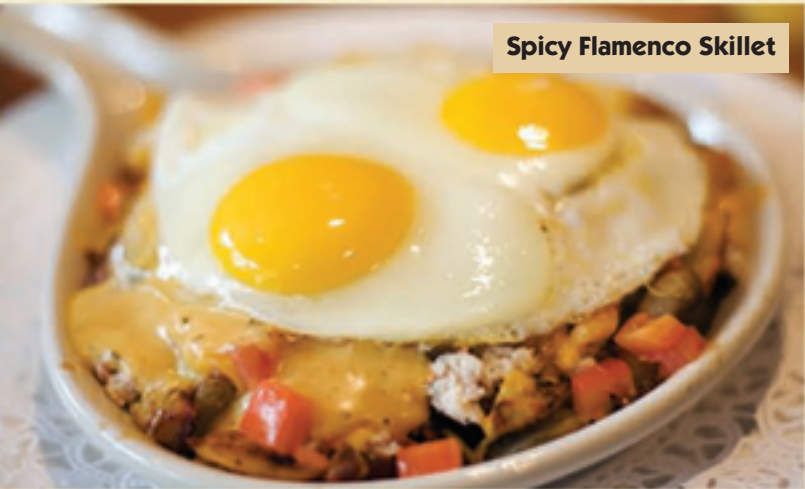
Spicy Flamenco Skillet