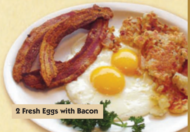
2 Fresh Eggs with Bacon