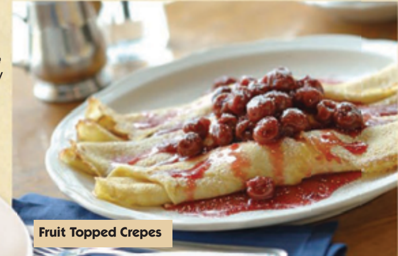
Fruit Topped Crepes