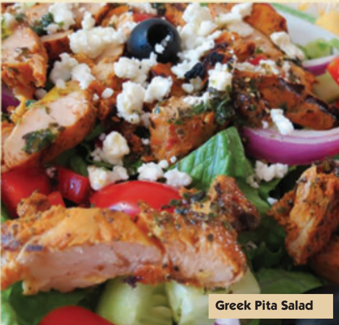
Greek Pita Salad