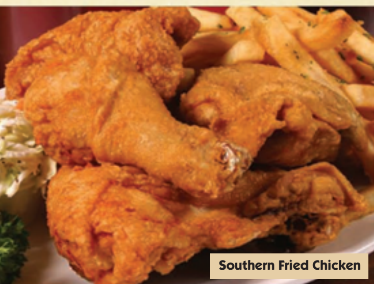
Southern Fried Chicken