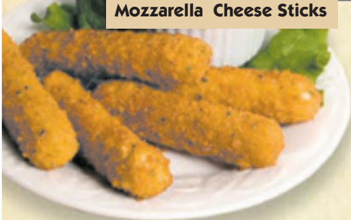
Mozzarella Cheese Sticks