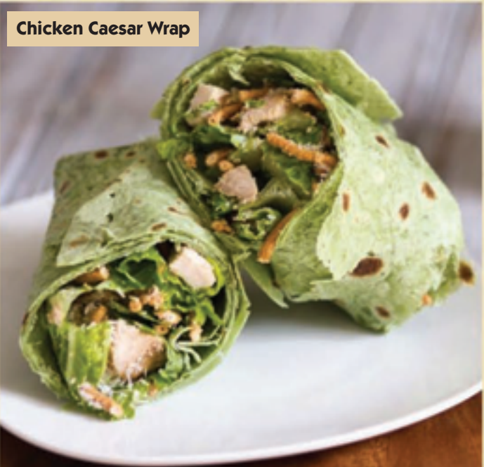
Chicken Caesar Wrap