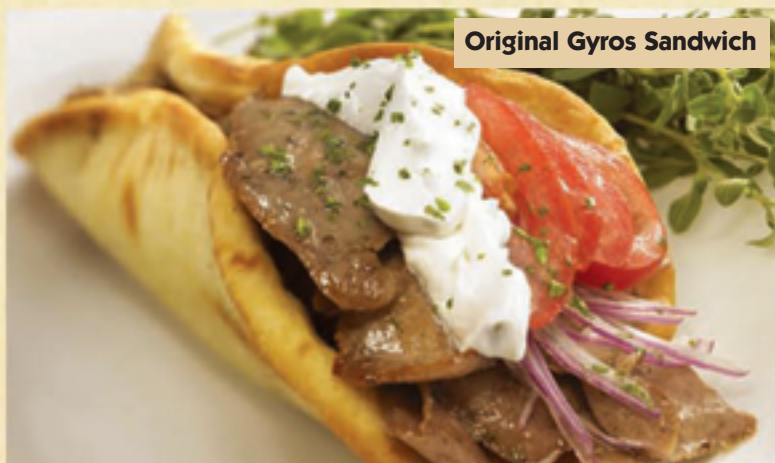
Original Gyros Sandwich