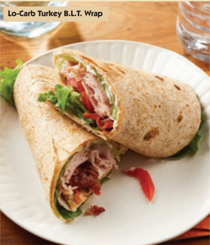
Lo-Carb Turkey B.L.T. Wrap

Our garlic herb tortilla is stuffed with corned beef, sauerkraut, Swiss cheese and Thousand Island on the side - 8.99