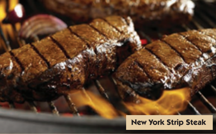
New York Strip Steak