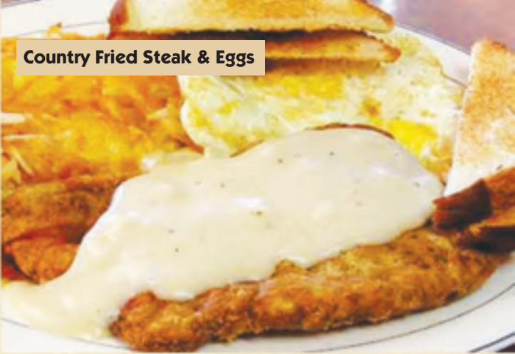
Country Fried Steak & Eggs