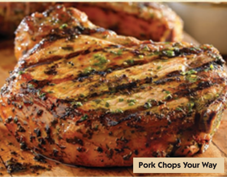
Pork Chops Your Way